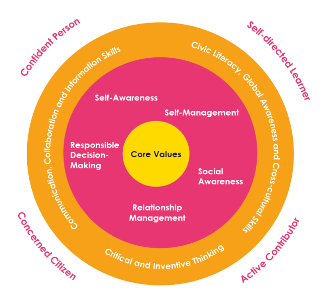
Figure 1.1 Framework for 21st Century Competencies and Student Outcomes

Knowledge and skills must be underpinned by values. Values define a person's character. They shape the beliefs, attitudes and actions of a person, and therefore form the core of the framework of 21st Century Competencies (21CC).